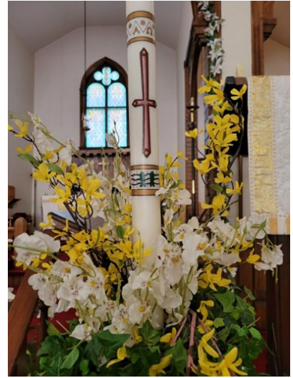
The Paschal candle has a new look – love the colors!