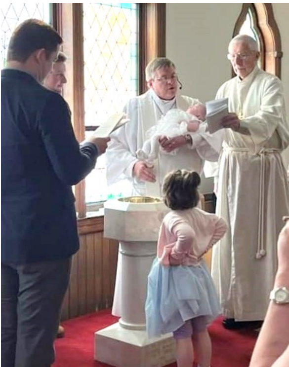
She didn't cry and he didn't drop her – a good sign