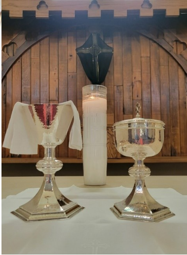
On the stripped altar