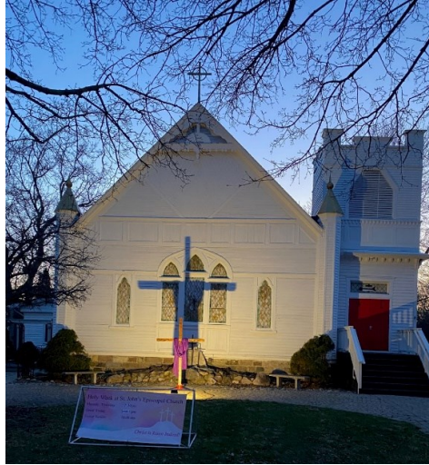
The shadow of the cross