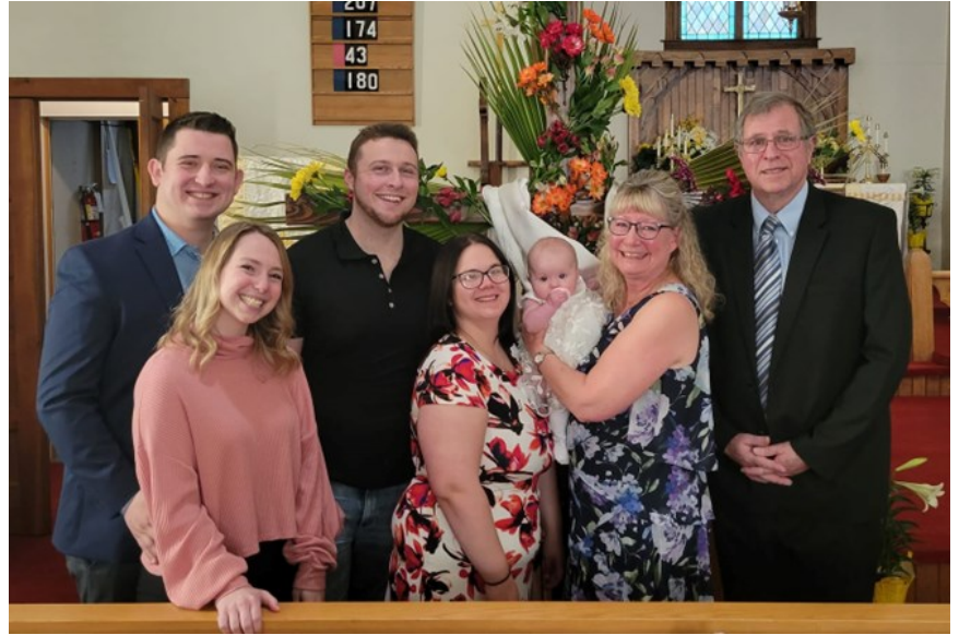
The happy family in front of the Easter cross